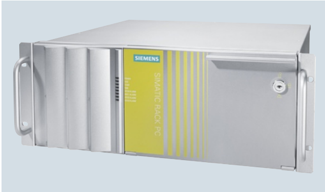
IPC547E, front view

The SIMATIC IPC547E is a rugged industrial PC in 19" rack design (4 HU).