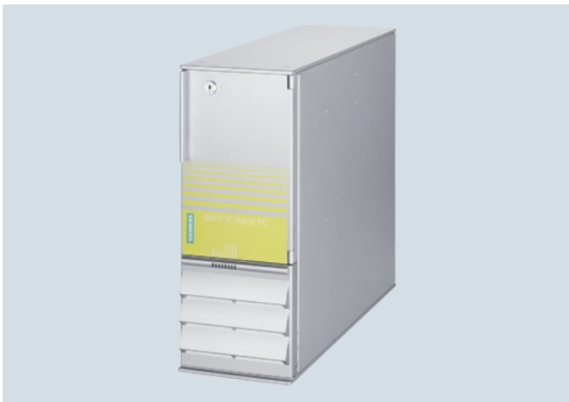
IPC547E with tower kit

A tower kit can be ordered as an accessory for converting the computer into an industrial tower PC.