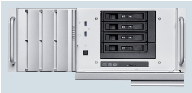
IPC547E, front view with front lid open