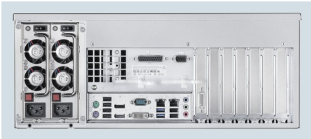
IPC547E, rear view

A tower kit can be ordered as an accessory for converting the computer into an industrial tower PC.